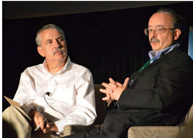
Thomas Friedman and Amory Lovins