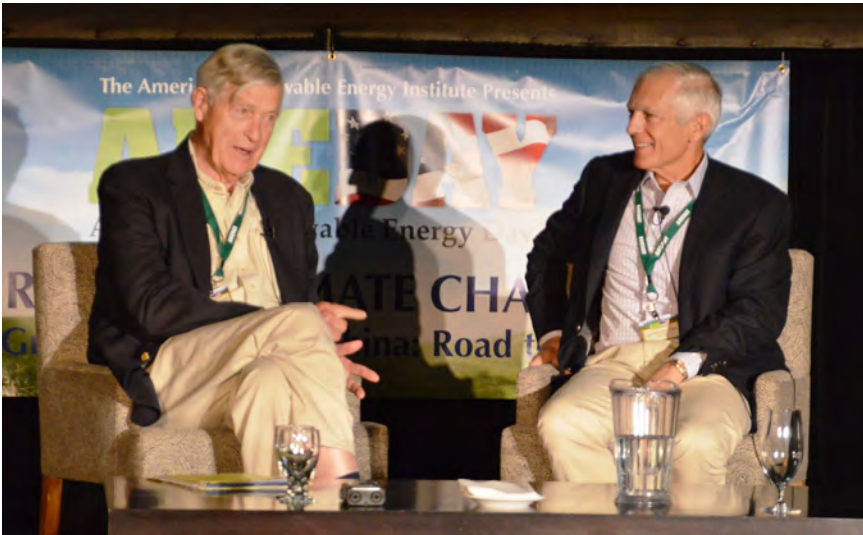
Tim Wirth and General Wesley Clark