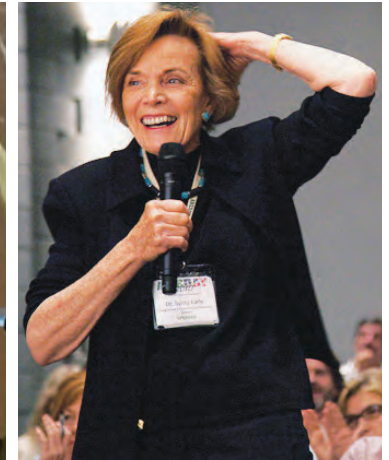
Dr. Sylvia Earle