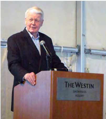
Ólafur Ragnar Grímsson, The President of Iceland