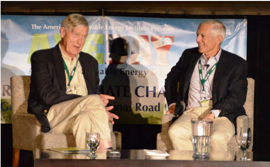
Tim Wirth and General Wesley Clark

President Jimmy Carter , 39th President of the United States