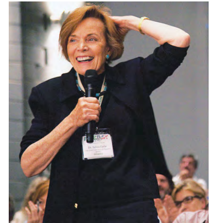
Dr. Sylvia Earle