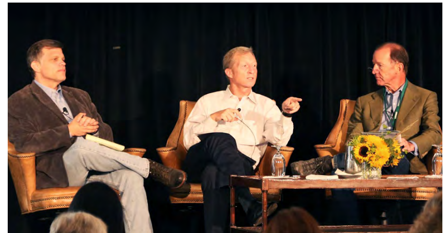
Douglas Brinkley, Tom Steyer, and Theodore Roosevelt IV