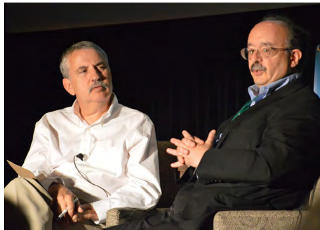
Thomas Friedman and Amory Lovins